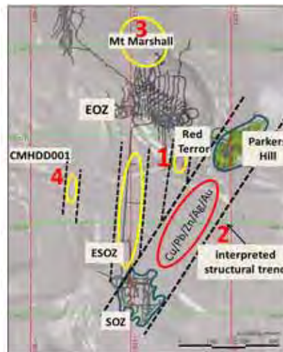
Figure 2: Plan of Mineral Hill showing prioritised mineralisation targets

Kimberley management are confident that, with drilling of its high priority exploration targets over the next year at Mineral Hill (refer to Figure 2), these Resources may be further upgraded and the current production profile will be materially extended. This would enable an expanded production profile of 400,000 tonnes of ore per annum for at least ten years.